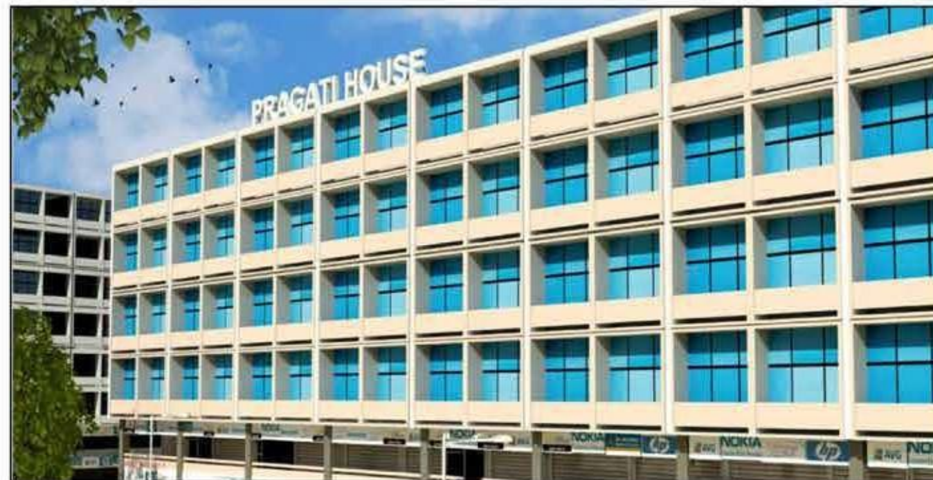
PRAGATI HOUSE (1976)

Residential Project, Nehru Place, New Delhi