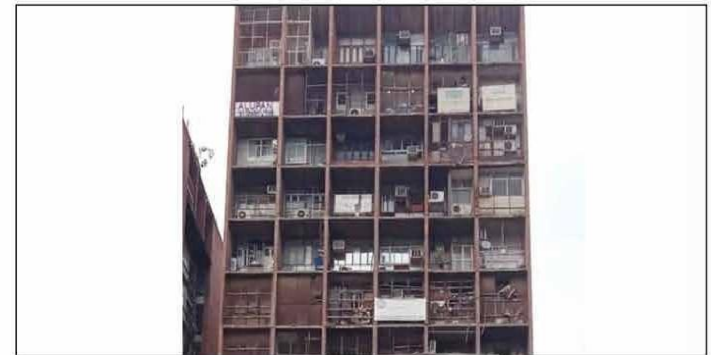
PRAGATI TOWER (1980)

Commercial Project, Nehru place, New Delhi