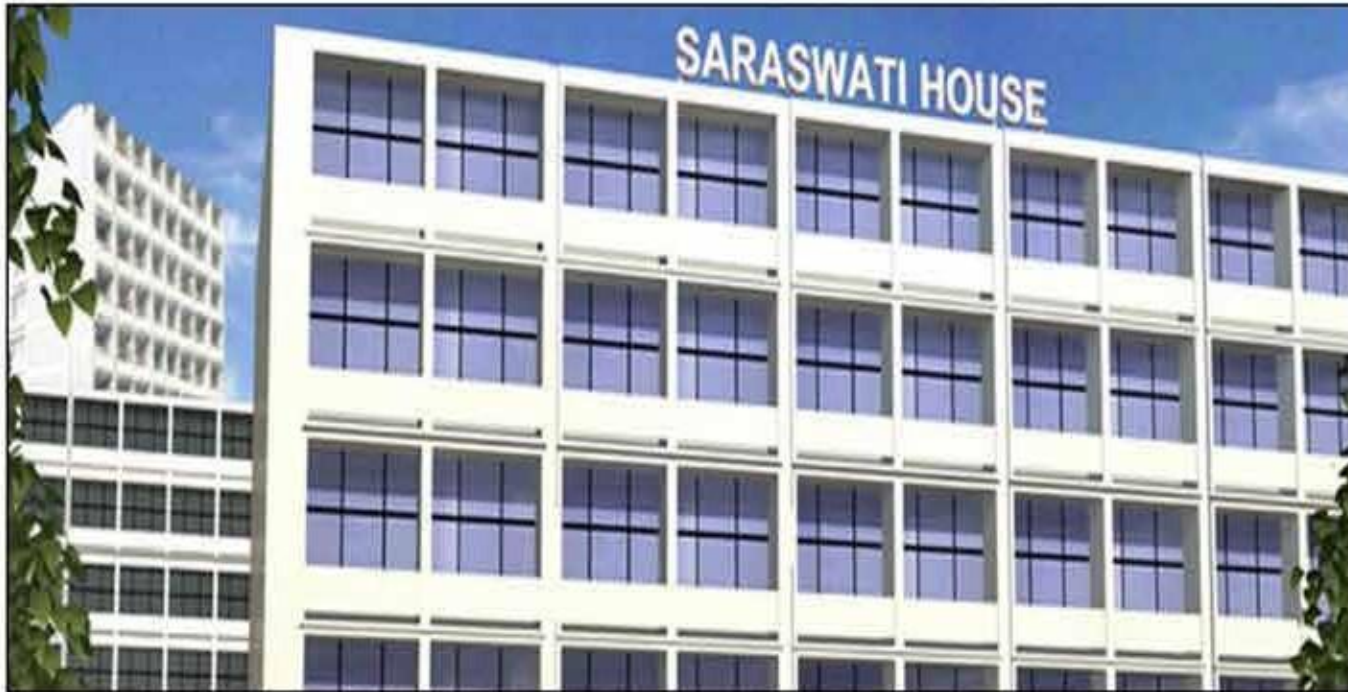
SARASWATI HOUSE (1975)

Commercial Project, Nehru place, New Delhi