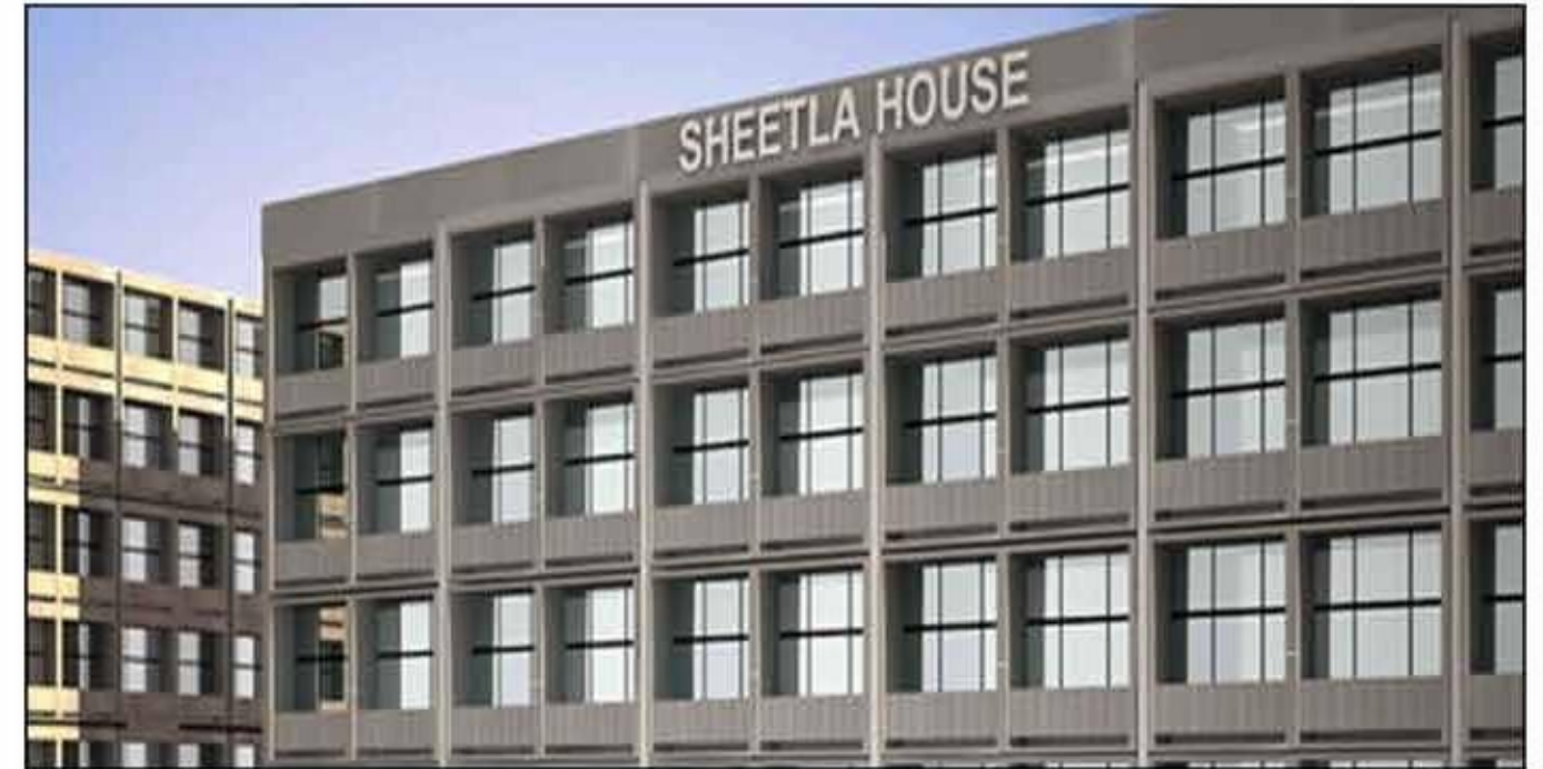
SHEETLA HOUSE (1978)

Commercial Project, Nehru place, New Delhi